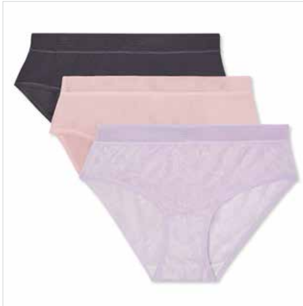
George Women's Microfiber Hipster

Feel smooth and sleek with this set of three George women's microfiber hipster panties. Their seamless design provides coverage and comfort throughout the day.