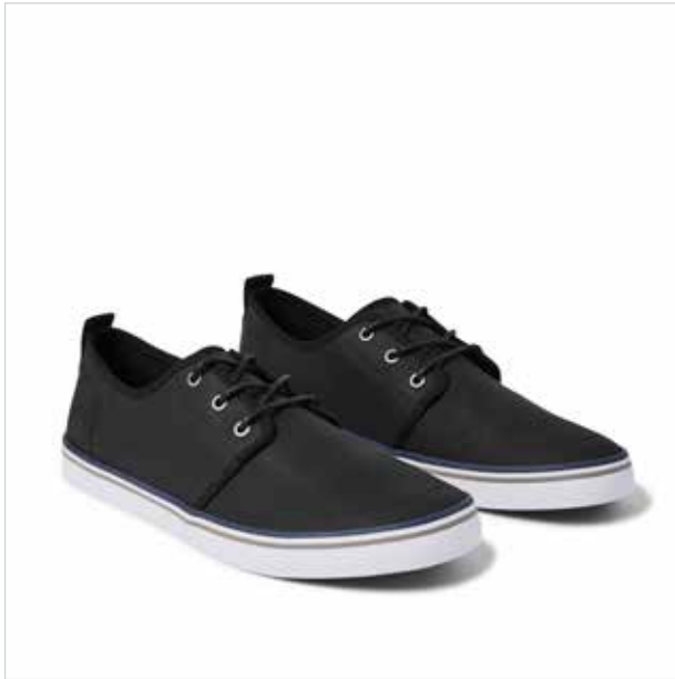
George Men's Rex Casual Shoe

Step out in style with this pair of casual George men's Rex sneakers. Their perforated microsuede exterior adds style and function to keep feet cool with added breathability.