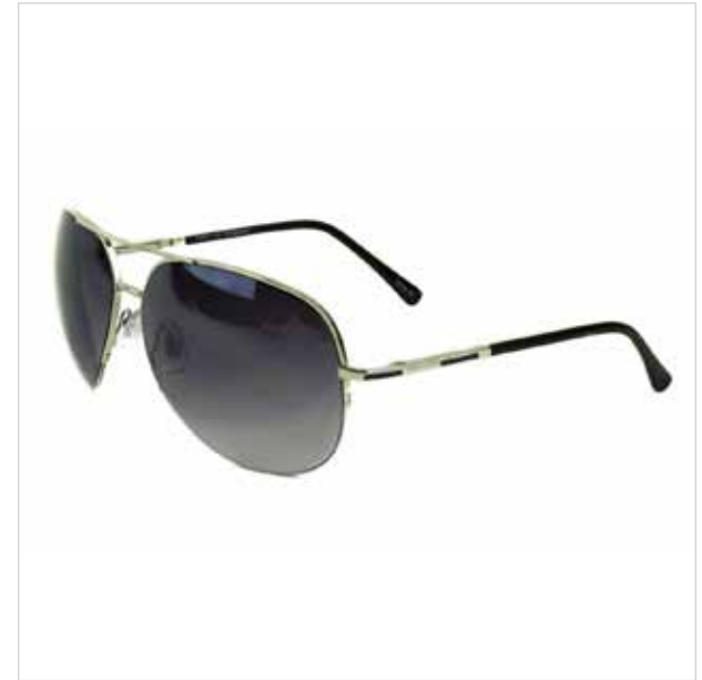
George Women's Silver Aviator Sunglasses

These George Women's oversized glasses are perfect to dress up any outfit. They feature a silver frame with black temples, and a gradient smoke lens.