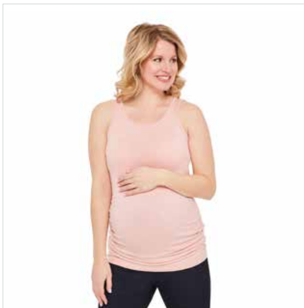
George Maternity Printed Jersey Tank

Layer up in our George maternity jersey tank throughout your pregnancy. This lightweight tank features ruched side details and plenty of room for a growing belly.