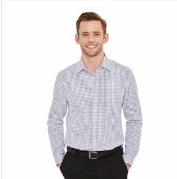
George Men's Oxford Shirt

This men's Oxford shirt is a must-have for any wardrobe! This versatile button-up can go with you from a day at the office to a night on the town and anywhere in-between