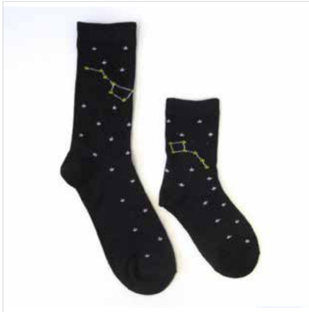
George Mother &amp; Child Matching Crew Socks

Mom and child can kick it together with this set of matching crew socks from George. Both pairs feature a matching astronomy design that will make them both smile.