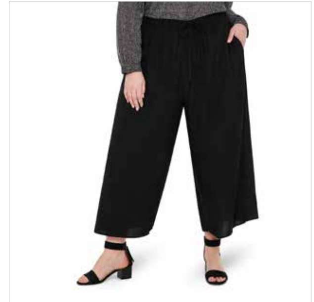
George Plus Women's Drapey Open Leg Pant

Reach for this pair of George Plus women's open leg pants that have a draped fit and wide leg design to keep you feeling your best.