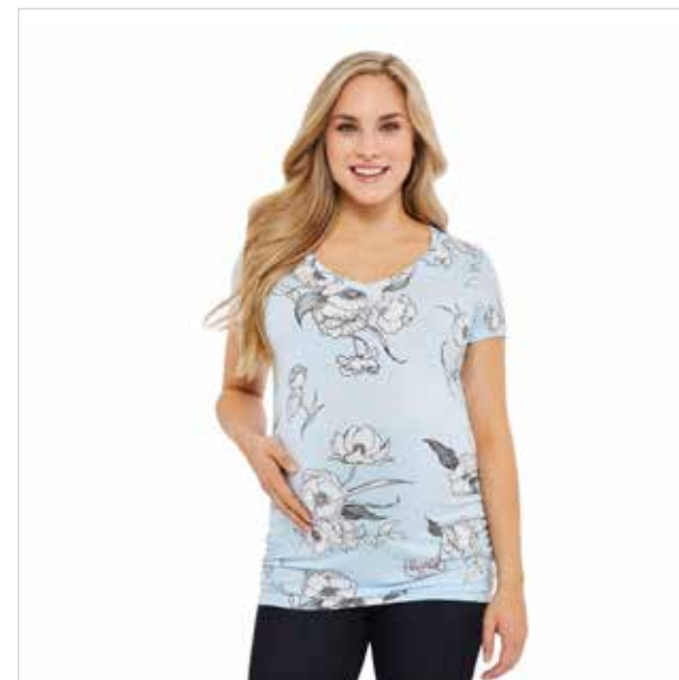
George Maternity V-Neck Tee

This George maternity V-neck t-shirt is an essential piece of your pregnancy wardrobe. With ruched side details and a front panel that can grow with you, you'll want to wear this every day!