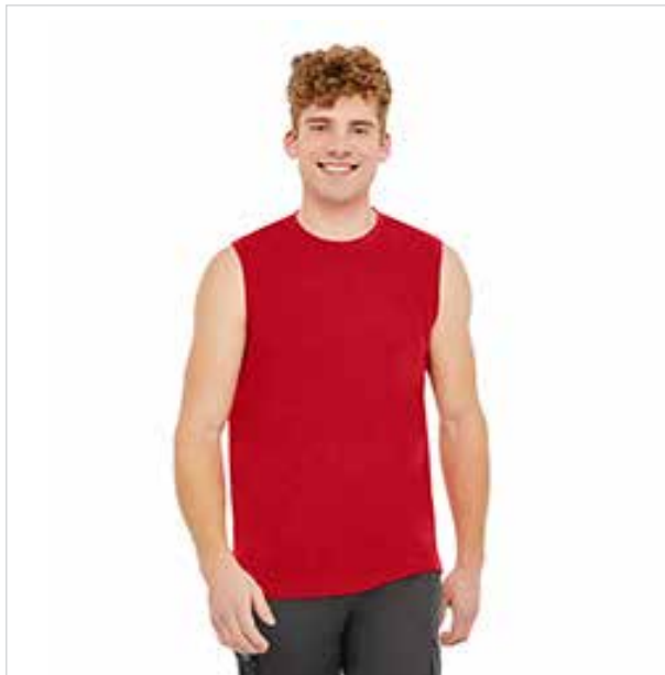
George Men's Jersey Muscle Top

Wash and wear this airy George men's muscle tank made from 100% cotton jersey. Whether you're hitting the gym or the streets, you'll feel and look cool.