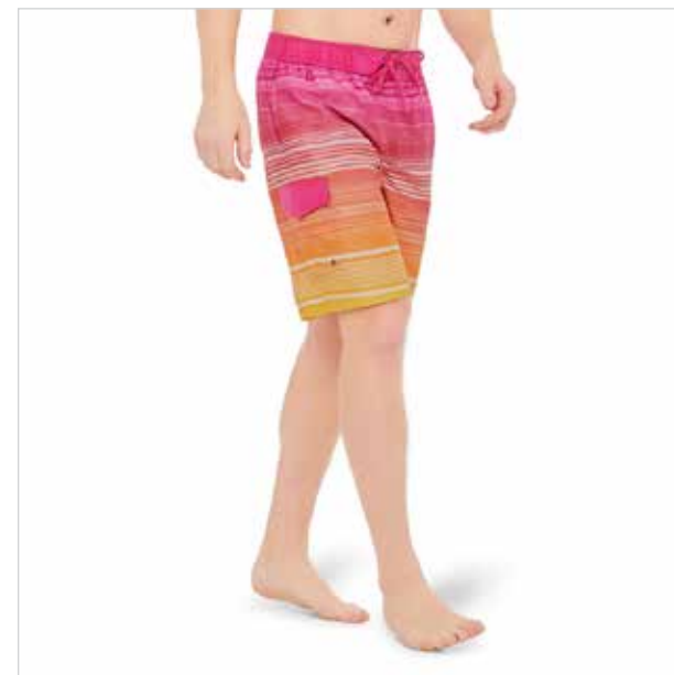
George Men's Swim Shorts

Add a cool and casual vibe to any outfit with this women's graphic tee. This t-shirt has a boxy cut and crew neckline that adds a relaxed feel to your look.