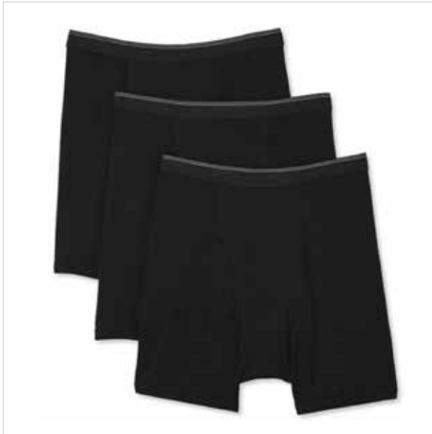
George Men's Big &amp; Tall Boxer Briefs 3-Pack

This set of three George Men's Big & Tall boxer briefs make a great start to your daily look. Get all-day comfort and breathability from 100% cotton fabrication.