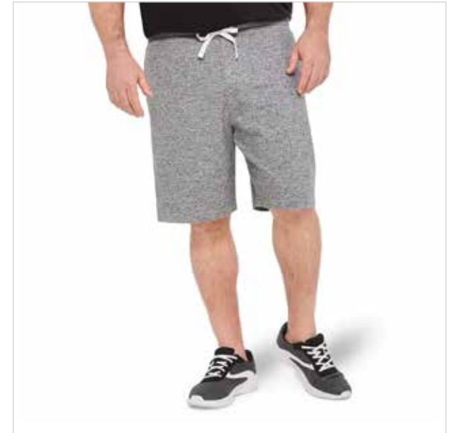
Canadiana Men's Big & Tall Knit Shorts

Bring the comfort of joggers into the summer. These knit shorts are great for active outings or casual days in the sun.