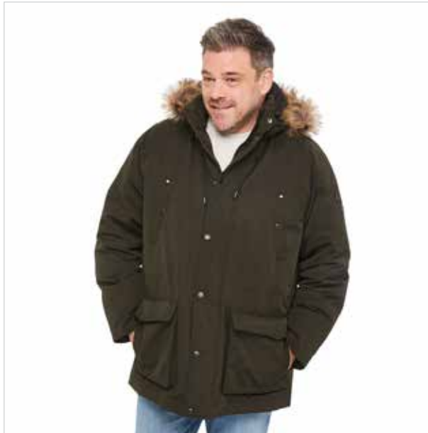
Canadiana Men's Big & Tall Hooded Parka Jacket

Weather the storm in this winter-ready parka. It comes with reflective trim and tight cuffs that will protect you all winter long.