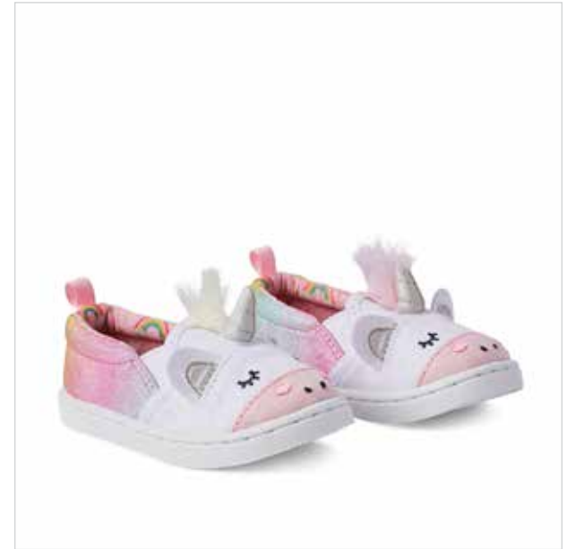
George Girls' Unicorn Casual Shoes

She'll love the easy wear and fun print of these George girls' unicorn sneakers. With a slip-on design and printed side panel, these will become her new go-to casual shoes.