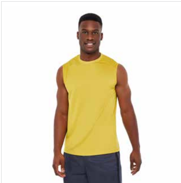
Athletic Works George Men's Muscle Tank

Hit your stride in this Athletic Works men's muscle tank. This classic design is made with moisture wicking fabric to keep you feeling cool and dry for peak performance.