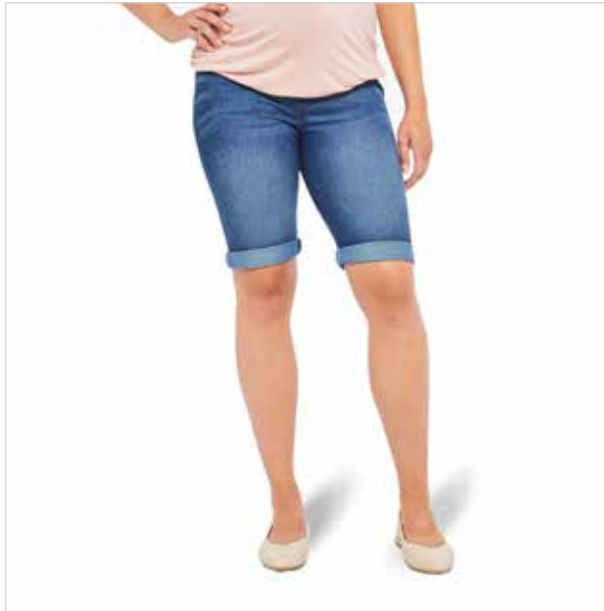
George Maternity Bermuda Joggings Shorts

Stay cool throughout your pregnancy with this pair of George maternity Bermuda shorts. Made from stretch denim with an expandable waistband, these shorts can keep up with your growing tummy.