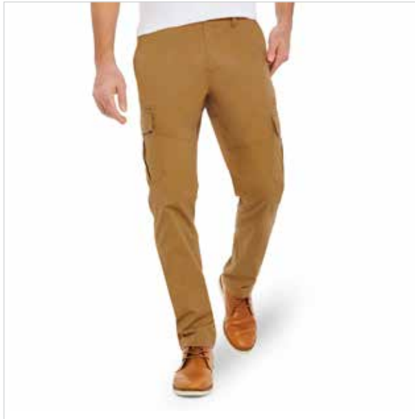
George Men's Slim Cargo Pants

Our George men's slim cargo pants give you all the pocket space you need along with the slim fit that you love.