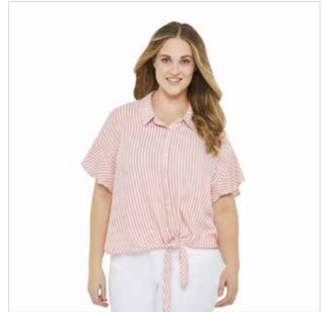
George Plus Women's Ruffle Sleeve Tie Front Shirt

You'll be in on the latest trends in this ruffled tie-front shirt. It has a cropped fit that pairs perfectly with high waisted jeans for an easy everyday look.