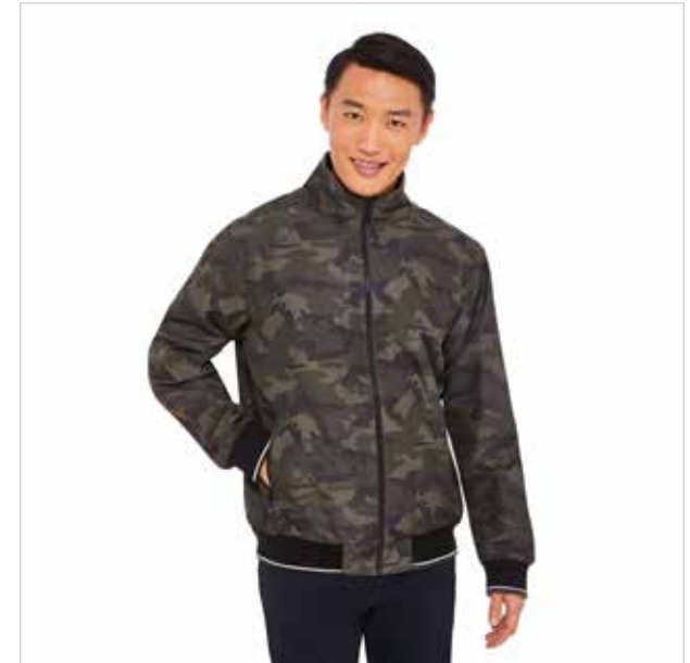
George Men's Bomber Jacket

Layer up with this men's printed camouflage bomber jacket that can be worn year-round. This lightweight jacket adds a stylish and casual feel to your everyday look.