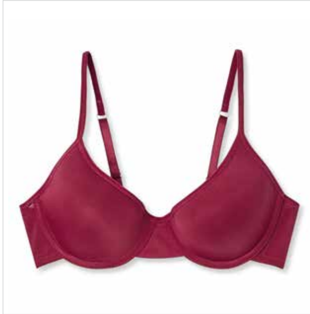
George Women's T-Shirt Bra

Start your outfit with the basics! This George women's t-shirt bra provides smooth coverage and medium support that's perfect for wearing under your favourite tees and tanks.