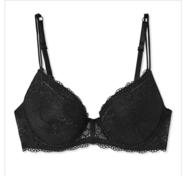
George Women's Floral Lace T-Shirt Bra

This George Women's lace t-shirt bra provides a smooth look that you can wear under your favourite tees. Its all-over lace design makes this an extra-special piece that can be worn every day.