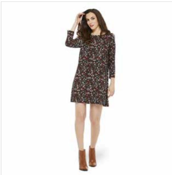
George Women's Keyhole Back Swing Dress

Step out in this eye-catching keyhole back swing dress by George for your next night on the town. It has an all-over print that can be dressed up or down, and an A-line fit to flow over the body.