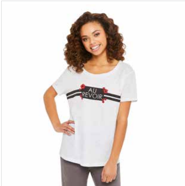
George Women's Graphic Tee

Add a cool and casual vibe to any outfit with this women's graphic tee. This t-shirt has a boxy cut and crew neckline that adds a relaxed feel to your look.