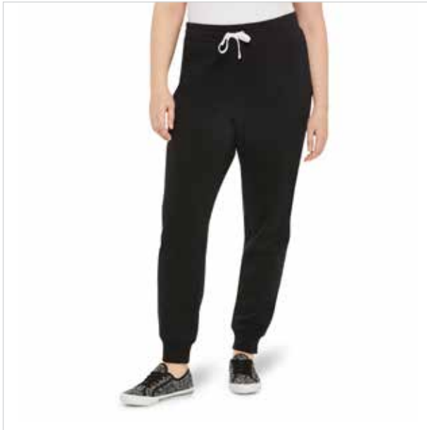
George Women's Cuffed Jogger

Kick back and relax in our ultra-soft George women's cuffed joggers. This slim fit cut maintains your comfort throughout the day without extra bulk.