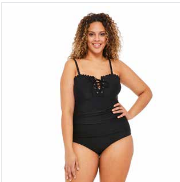
George Plus Women's Scallop 1-Piece Swimsuit

Flatter your figure with our George Plus women's scalloped one-piece swimsuit. Look equally stylish on the beach or in the water with this swimsuit that doubles as a bodysuit for added versatility.