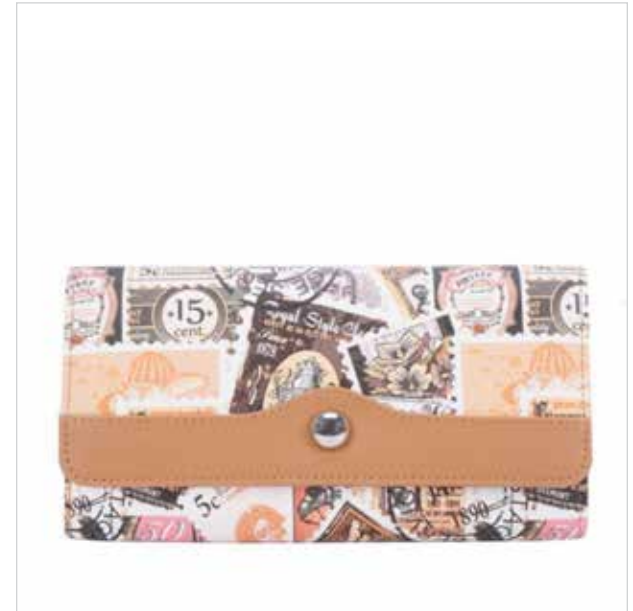
George File Master Wallet

Keep your cards safe in this George women's file master wallet that comes in an all-over stamp print. Multiple interior slots hold room for up to 10 cards while a zippered pocket keeps change in place.