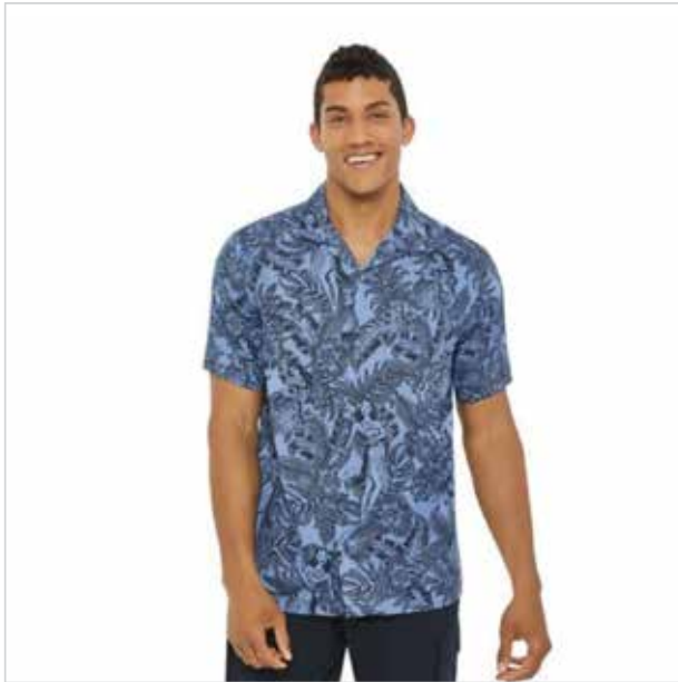
George Men's Resort Shirt

Let every day feel like you're on vacation in this men's resort shirt. This classic fit button-up has short sleeves and an all-over tropical print to keep you looking and feeling cool.