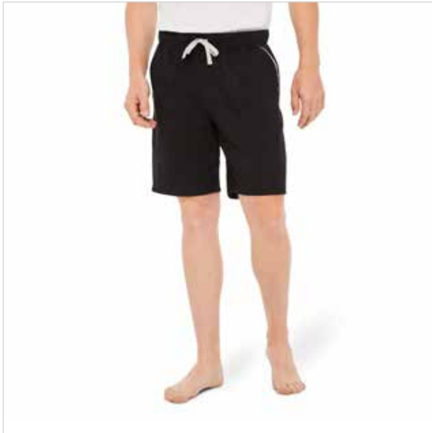
George Men's Sleep Short

Sleep comfortably in these George men's sleep shorts that are made from 100% cotton jersey to keep you feeling cool throughout the night.