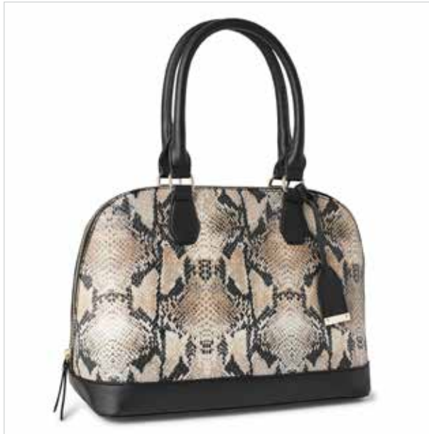
George Women's Convertible Dome Satchel

Gift yourself two looks in one with this convertible satchel featuring sturdy dome handles and a cross-body strap for multiple looks.