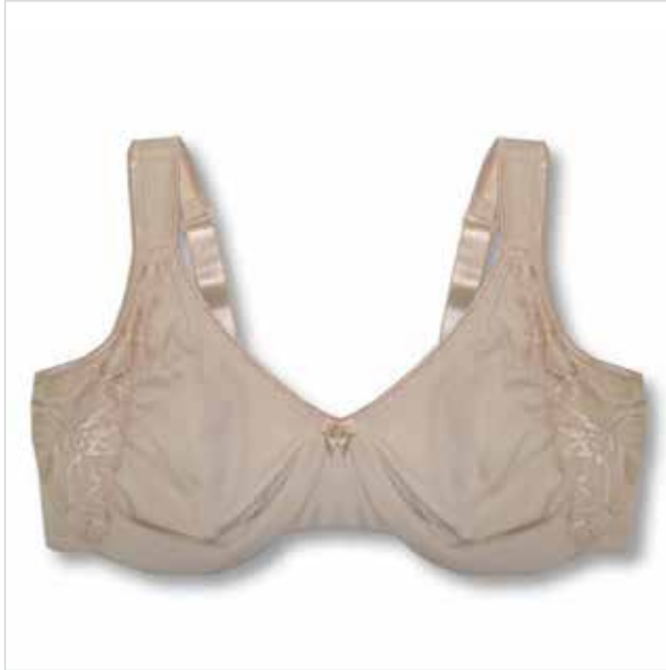
George Plus High Support Full Figure Seamless Bra

Get the support you're looking for with this George Plus women's full figure seamless bra. It's the perfect underpinning for your fitted blouses and won't show through thanks to its seamless design.