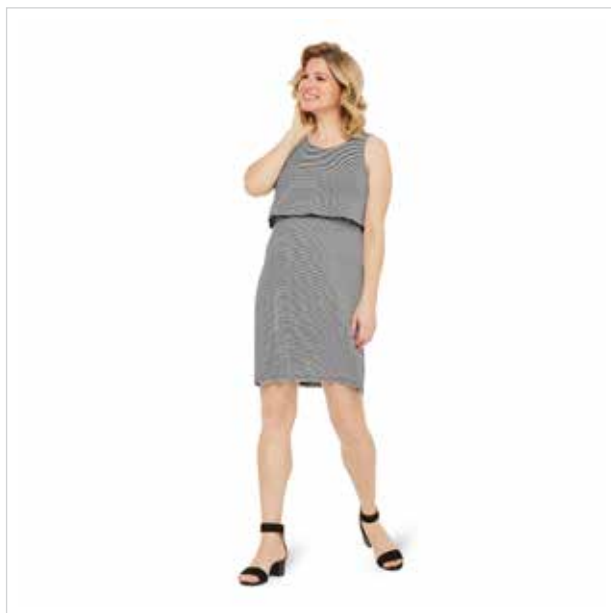
George Women's Maternity Two-Tiered Nursing Dress

Look and feel stylish when you're out and about in this two-tiered nursing dress. With front panels that make it easy to nurse, you'll feel comfortable feeding anywhere.