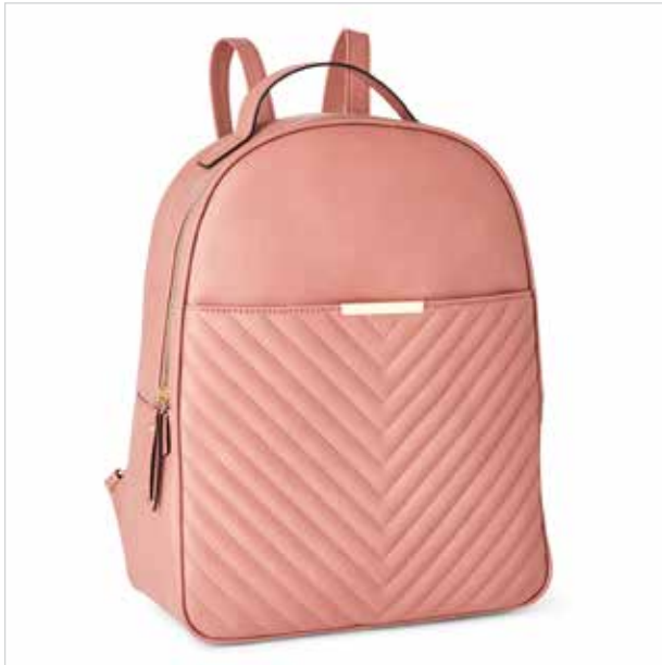
George Women's Quilted Backpack

Get going and look good doing it in this in-trend quilted backpack with gold accents and a top handle.