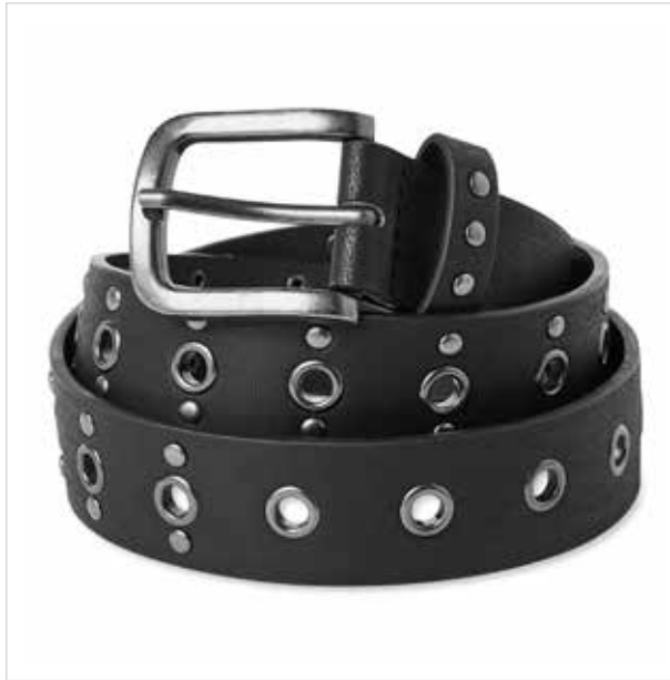
George Boys' 30 mm Faux Leather Belt with Eyelets

The perfect belt to wear with jeans. It comes with multiple size options with eyelets that allow for maximum size adjustment.