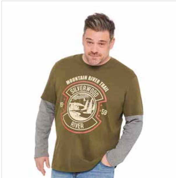
George Men's Big & Tall Graphic Follower T-Shirt

Pair this faux-layered graphic tee with a pair of jeans for a trendy, casual look that takes minimal effort.