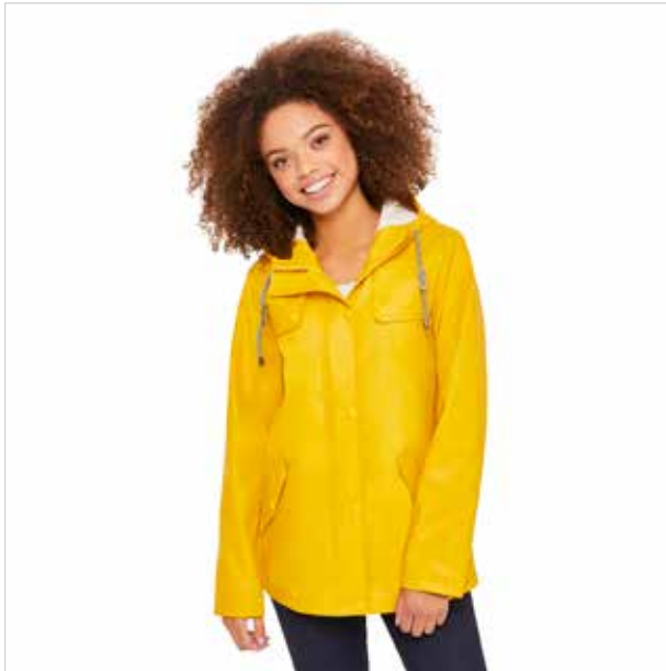
George Women's Rain Jacket

Reach for this bright and cheery, fitted women's rain jacket on a rainy day. Stay dry and stylish with a drawstring adjustable hood and front pockets for your keys, phone and more.