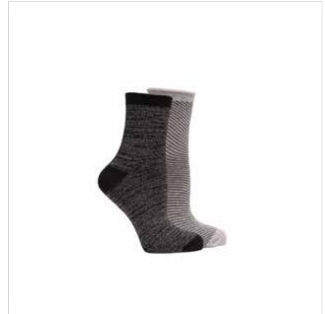
George Women's 2-Pack Fashion Crew Sock with Lurex Accent

This set of George women's crew socks are the essential pairs that every wardrobe needs. Their classic design provides comfort and style that can be worn everyday.