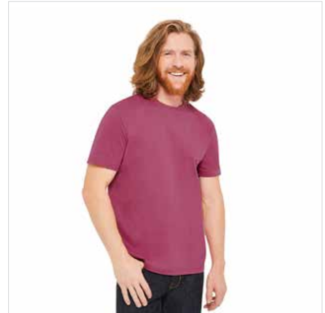
George Men's Basic T-Shirt

A classic tee like this men's crew neck never goes out of style! This season's hottest colours are a great addition to your casual wardrobe.