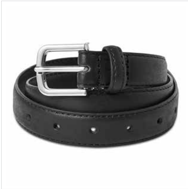
George Boys' 25 mm Feather Edge Dress Belt

A smooth leather-like feel and feather edges make this belt ideal to wear with dress pants and casual wear. It features five holes for size and comfort adjustment.