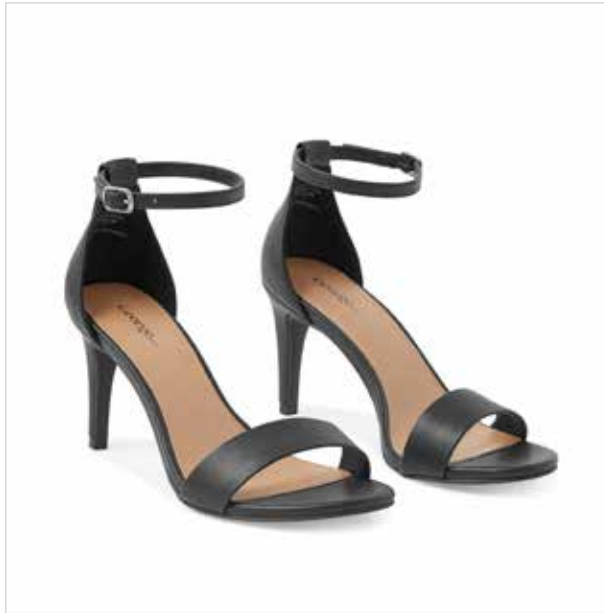
George Women's Amanda Heels

For your next special occasion, step out in this pair of classic two-strap pumps.