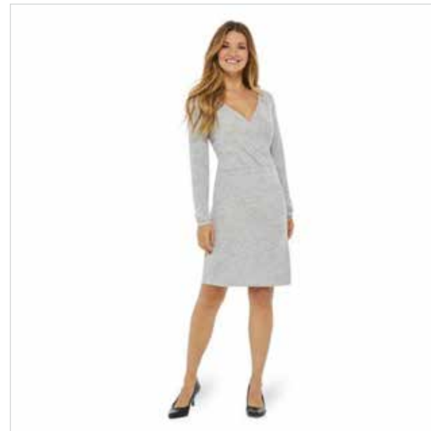
George Women's Faux Wrap Dress

Pull on this chic George women's faux wrap dress that has all the appeal of a wrap dress with none of the fuss. Its 1-piece construction makes for easy and comfortable all-day wear.