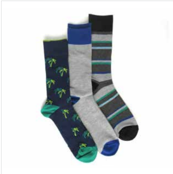
George Fun Patterned Socks for Men

Keep feet happy with our George men's socks. Made for everyday wear, these socks have an elastic cuff to stay in place and a reinforced heel for added comfort. Three pairs.