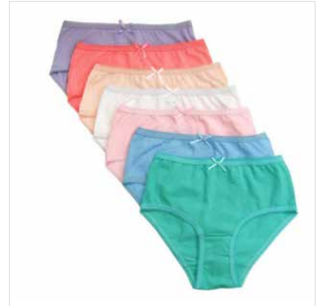
George Girls' Cotton Briefs 7-Pack

These essential George girls' briefs are the perfect starting point for your look. Get all-day comfort and breathability from 100% cotton construction.