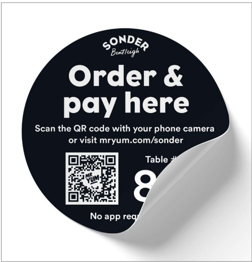
Vinyl stickers The Abel Collective pricing: