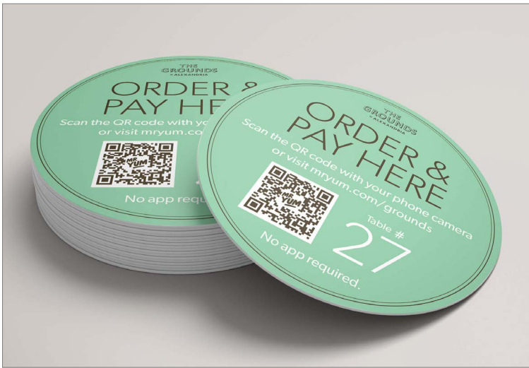
Outdoor PVC disks The Abel Collective pricing:

Feel free to get in touch with Matt at matt@theabelcollective.com to get a custom quote.