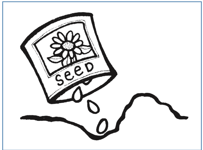
Dig a hole or row to plant seeds.