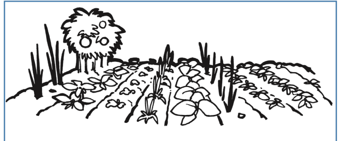
Plant vegetables in rows.

Now that you've planned your garden, it's time to buy the seeds or plants. Many fruits and vegetables grow easily from a seed, but you might have better luck starting with a seedling.