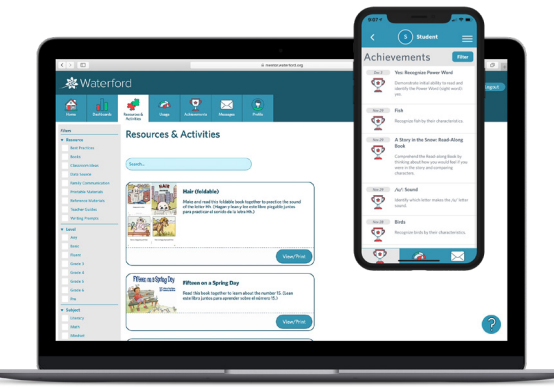
Waterford Mentor is available online and in the Mentor app (for iOS and Android).

What Is Rhyming?, Which Words Rhyme?, Sentences Are Made Up of Words, Making Compound Words, Breaking Compound Words, What Is a Syllable?, Put Syllables Together to Make Words, Break Words into Syllables, The First Sound in a Word, Words with the Same First Sound, Making Words from First Sounds and the Rest