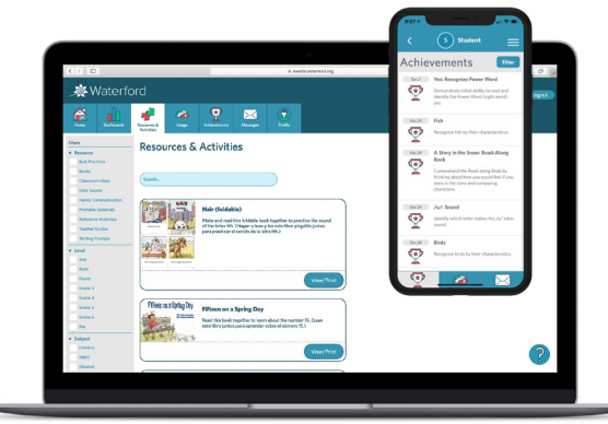
Waterford Mentor is available online and in the Mentor app (for iOS and Android).

What Is Rhyming?, Which Words Rhyme?, Sentences Are Made Up of Words, Making Compound Words, Breaking Compound Words, What Is a Syllable?, Put Syllables Together to Make Words, Break Words into Syllables, The First Sound in a Word, Words with the Same First Sound, Making Words from First Sounds and the Rest