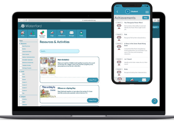
Waterford Mentor is available online and in the Mentor app (for iOS and Android).

What Is Rhyming?, Which Words Rhyme?, Sentences Are Made Up of Words, Making Compound Words, Breaking Compound Words, What Is a Syllable?, Put Syllables Together to Make Words, Break Words into Syllables, The First Sound in a Word, Words with the Same First Sound, Making Words from First Sounds and the Rest