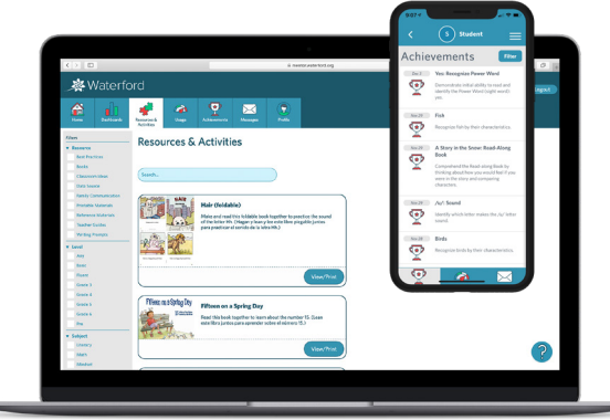
Waterford Mentor is available online and in the Mentor app (for iOS and Android).

What Is Rhyming?, Which Words Rhyme?, Sentences Are Made Up of Words, Making Compound Words, Breaking Compound Words, What Is a Syllable?, Put Syllables Together to Make Words, Break Words into Syllables, The First Sound in a Word, Words with the Same First Sound, Making Words from First Sounds and the Rest