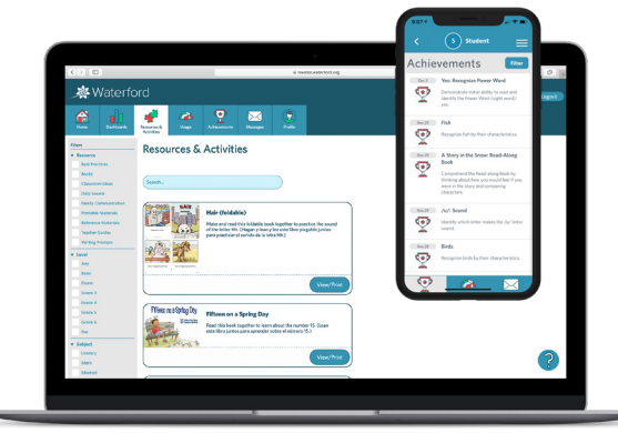
Waterford Mentor is available online and in the Mentor app (for iOS and Android).

What Is Rhyming?, Which Words Rhyme?, Sentences Are Made Up of Words, Making Compound Words, Breaking Compound Words, What Is a Syllable?, Put Syllables Together to Make Words, Break Words into Syllables, The First Sound in a Word, Words with the Same First Sound, Making Words from First Sounds and the Rest