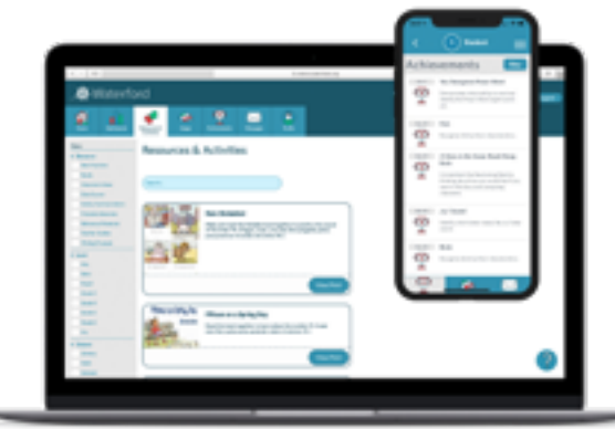
Waterford Mentor is available online and in the Mentor app (for iOS and Android).

What Is Rhyming?, Which Words Rhyme?, Sentences Are Made Up of Words, Making Compound Words, Breaking Compound Words, What Is a Syllable?, Put Syllables Together to Make Words, Break Words into Syllables, The First Sound in a Word, Words with the Same First Sound, Making Words from First Sounds and the Rest