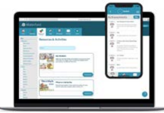
Waterford Mentor is available online and in the Mentor app (for iOS and Android).

What Is Rhyming?, Which Words Rhyme?, Sentences Are Made Up of Words, Making Compound Words, Breaking Compound Words, What Is a Syllable?, Put Syllables Together to Make Words, Break Words into Syllables, The First Sound in a Word, Words with the Same First Sound, Making Words from First Sounds and the Rest