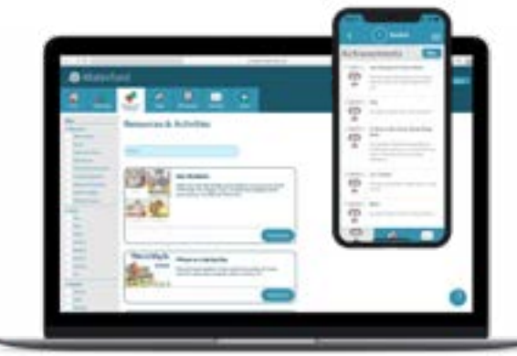
Waterford Mentor is available online and in the Mentor app (for iOS and Android).

What Is Rhyming?, Which Words Rhyme?, Sentences Are Made Up of Words, Making Compound Words, Breaking Compound Words, What Is a Syllable?, Put Syllables Together to Make Words, Break Words into Syllables, The First Sound in a Word, Words with the Same First Sound, Making Words from First Sounds and the Rest