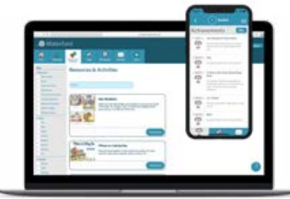
Waterford Mentor is available online and in the Mentor app (for iOS and Android).

What Is Rhyming?, Which Words Rhyme?, Sentences Are Made Up of Words, Making Compound Words, Breaking Compound Words, What Is a Syllable?, Put Syllables Together to Make Words, Break Words into Syllables, The First Sound in a Word, Words with the Same First Sound, Making Words from First Sounds and the Rest