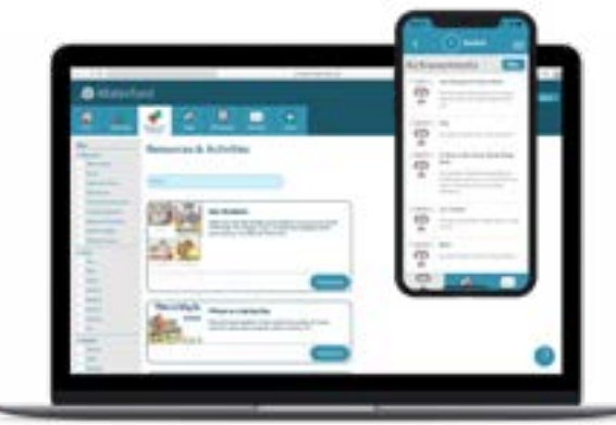
Waterford Mentor is available online and in the Mentor app (for iOS and Android).

What Is Rhyming?, Which Words Rhyme?, Sentences Are Made Up of Words, Making Compound Words, Breaking Compound Words, What Is a Syllable?, Put Syllables Together to Make Words, Break Words into Syllables, The First Sound in a Word, Words with the Same First Sound, Making Words from First Sounds and the Rest