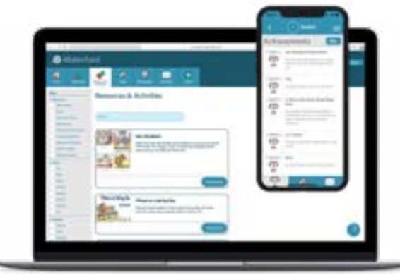
Waterford Mentor is available online and in the Mentor app (for iOS and Android).

What Is Rhyming?, Which Words Rhyme?, Sentences Are Made Up of Words, Making Compound Words, Breaking Compound Words, What Is a Syllable?, Put Syllables Together to Make Words, Break Words into Syllables, The First Sound in a Word, Words with the Same First Sound, Making Words from First Sounds and the Rest